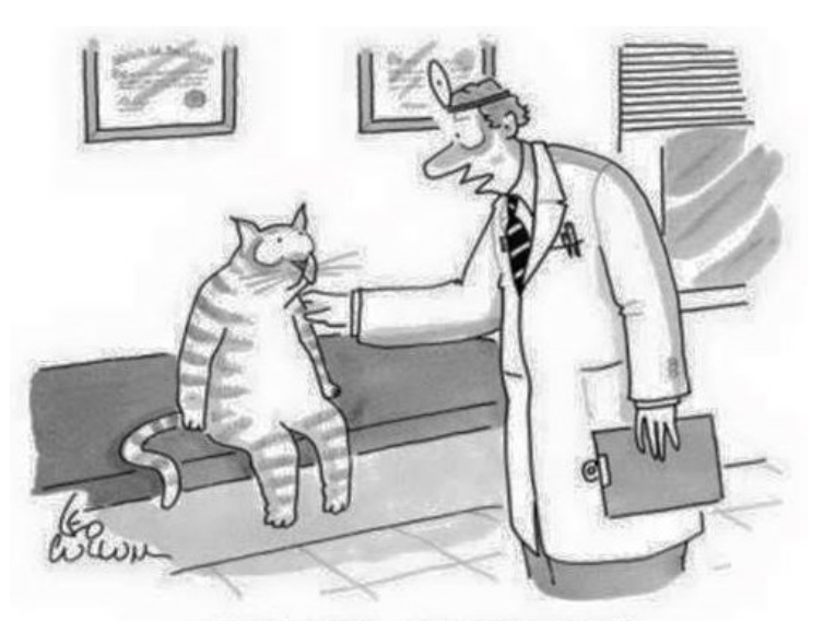
"Bad news, its curiosity"